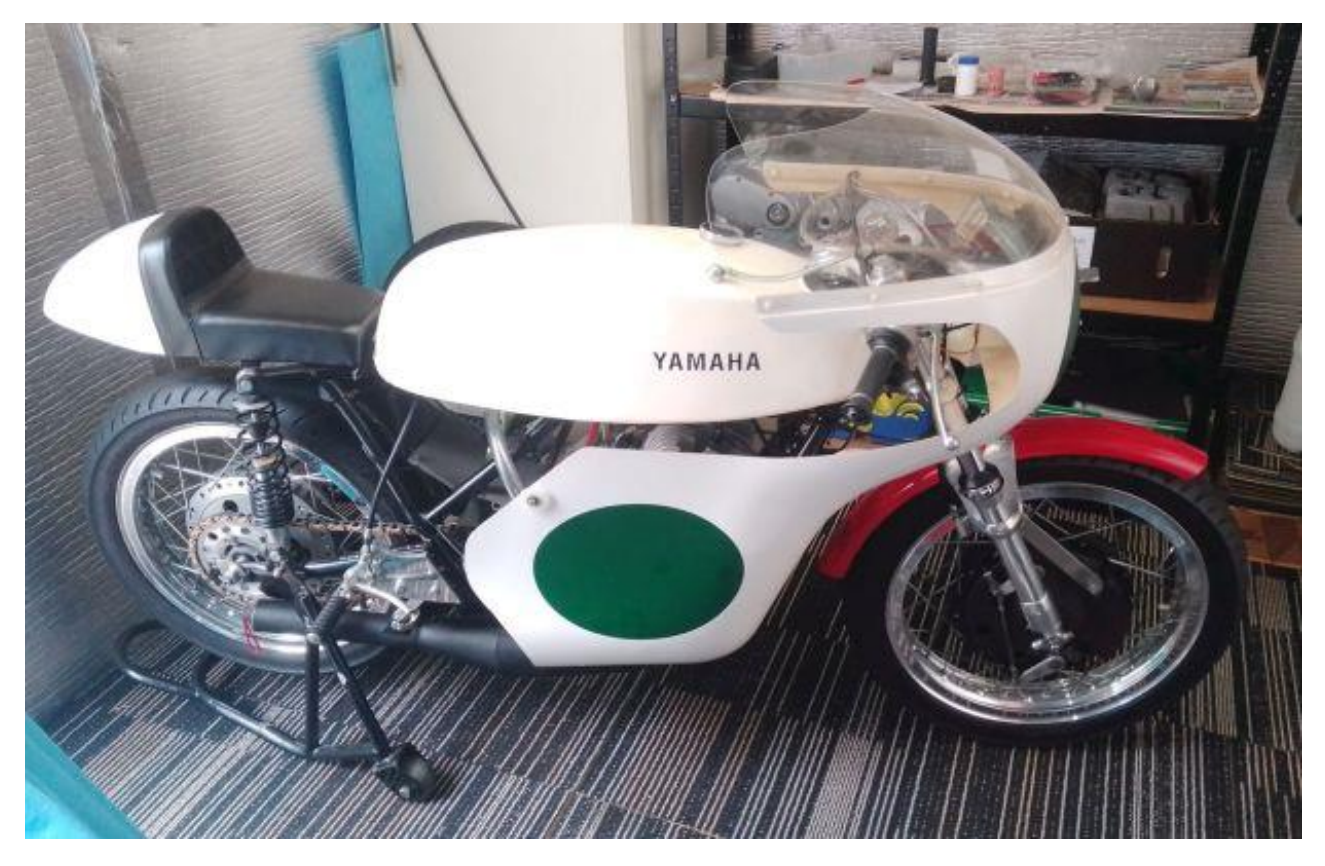
Rebuilt TD1C ready for track testing - September 2024